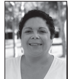
Counselor/Instructor Puente Program