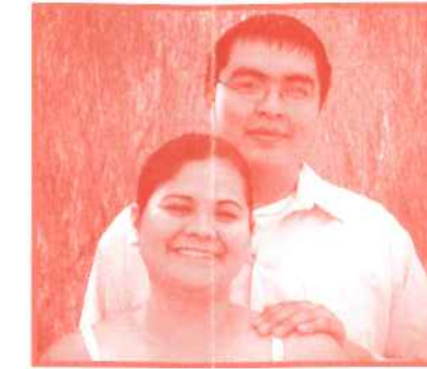
LHM 2005 Co-chairs