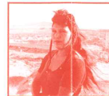
Film & Discussion: Señorita Extraviada Missing Young Woman