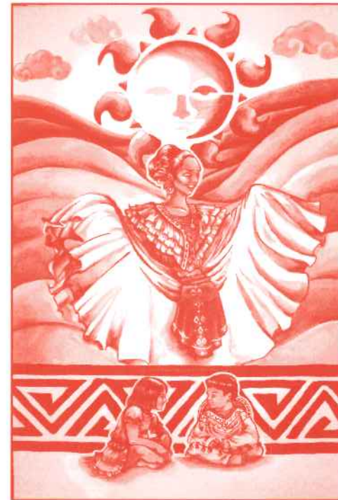
Artwork by Felicita Norris

Latino: La Luz del Futuro Latino: The Light of the Future