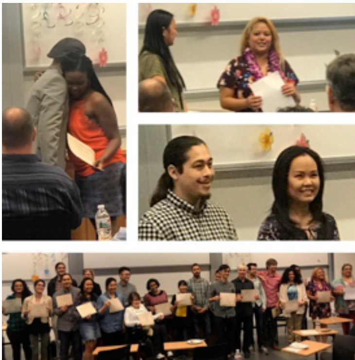
Annual Awards Ceremony, PSME Division