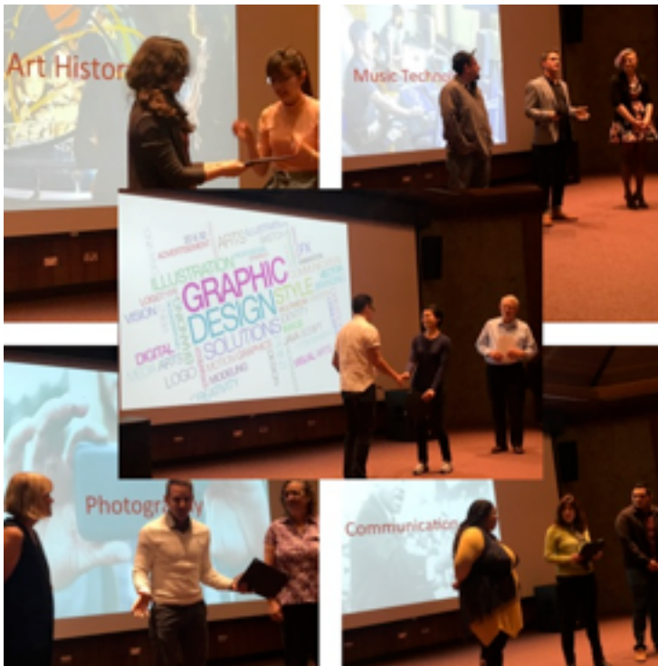
Distinguished Student Awards Ceremony, Fine Arts & Communications Division