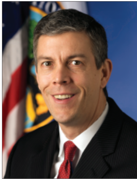
U.S. Secretary of Education Arne Duncan

From 1987 to 1991, Duncan played professional basketball in Australia, where he also worked with children who were wards of