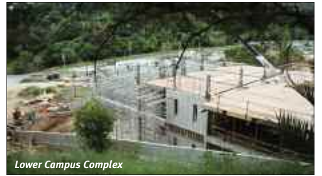
Lower Campus Complex

Lower Campus Complex —Construction of the Lower Campus Complex continues on schedule. This $45-million project includes construction of a three-story Student Services Building; a 200-seat theater; a single-story classroom building with three new lecture halls; a three-story Life Sciences Building; and associated single-story buildings to support the Environmental Horticulture and Veterinary Technology programs. The total square footage of all buildings is approximately 100,000 square feet. Completion of the project is expected in Fall 2007.