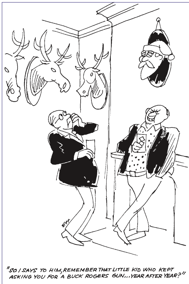
Illustration by Foothill Graphic Design Instructor Stan Ettinger.

Add a unique creative art to your portfolio by enrolling in the four-unit GID 72: Cartooning course this fall. Whether you're interested in creating comedy, developing eye-catching marketing artwork, or commenting with satire, you'll learn the fundamentals of drawing cartoons for mass communication. The course emphasizes humor and design skills, and includes an exploration of cartooning-related careers. For registration instructions, access www.foothill.edu or call (650) 949-7325.