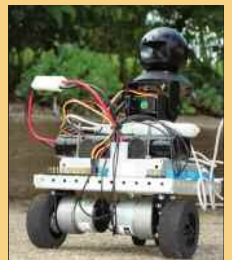
A sample TeRK you'll build in Foothill's ENGR 20 class.

For registration instructions, access www.foothill.edu or call (650) 949-7325.