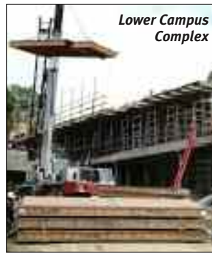
Lower Campus Complex

Completed projects include renovations to Buildings 1600, 1700, 1800, 2500, 2600, 2700, 2800, 3000, 3100, 3200, 3300, 4000, 4100, 4200, 4300, 5200 and 6000. The new Building 6700 and Central Plant have also been completed. Renovations have also been completed to parking lots 1, 1H, 2, 2A, 3, 5 and 7. Pedestrian crossings, some landscaping and renovation of the stadium, and practice field have also been completed.