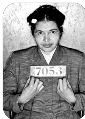
Civil rights activist Rosa Parks

For registration instructions, access www.foothill.edu or call (650) 949-7325.