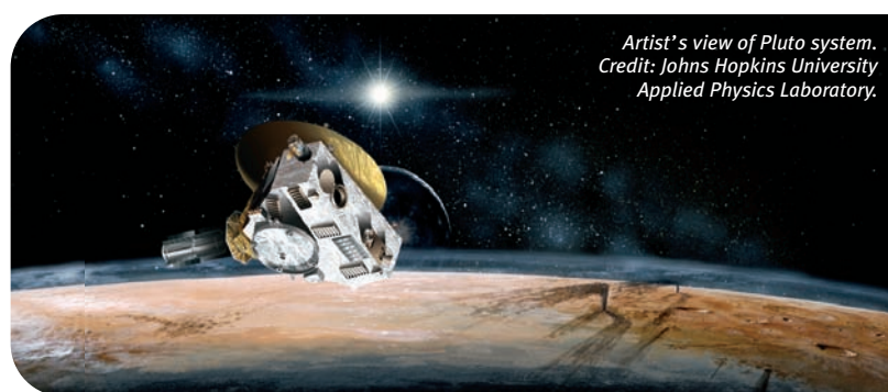
Artist's view of Pluto system.