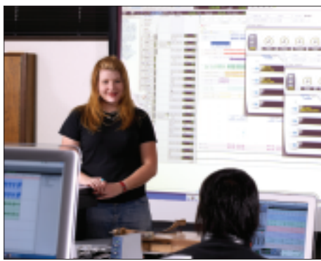
Foothill's 30-station IDEA Lab.

If you're a video or sound artist and want to improve the quality of your work or add sound effects to anything from simple home movies to more extravagant productions, Foothill offers you the four-unit MUS 81B: Sound Design for Film & Video course. From the basics of film and video sound, to adding sound