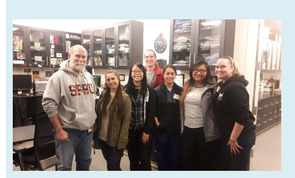
Cal Academy Of Science

situation, with a husband that created the perfect environment to hone her skills, she still faced many obstacles and obstructions that caused major bumps in the road. Everyone must start somewhere, and the best place to begin is in a clinic that makes you happy, surrounded by a network of people who will support you through any event that may come across. Don't let anything or anyone hold you back and follow your dreams to not only become and amazing person, but a super vet tech, and someone who can change the world with just their voice. Your opinion matters, stand up and fight for what you believe in! And who knows, maybe the next article will be written about you and your achievements!