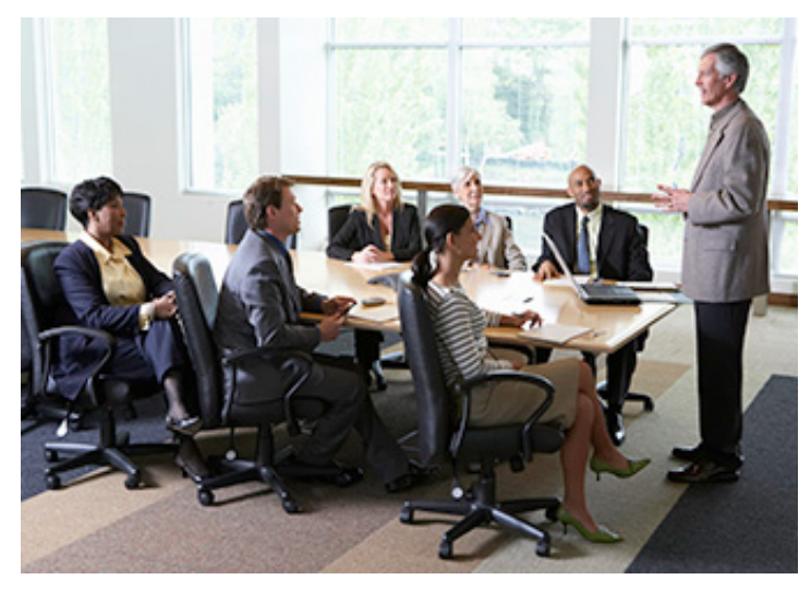
Advertising, promotions, and marketing managers may travel to meet with clients or representatives of communications media.

Advertising and promotions managers held about 31,300 jobs in 2016. The largest employers of advertising and promotions managers were as follows: