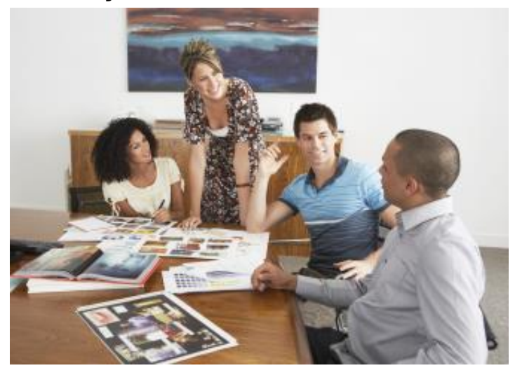
Advertising, promotions, and marketing managers inspect layouts, which are sketches or plans for an advertisement.