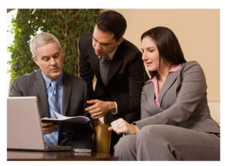
These managers typically have previous work experience in advertising, marketing, promotions, or sales.

A bachelor's degree is required for most advertising, promotions, and marketing management positions. These managers typically have work experience in advertising, marketing, promotions, or sales.