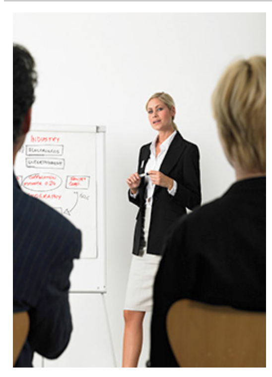
Advertising managers can be found in advertising agencies that put together advertising campaigns for clients, in media firms that sell advertising space or time, and in companies that advertise heavily.

Advertising, promotions, and marketing managers plan programs to generate interest in products or services. They work with <u>art directors</u>, <u>advertising sales agents</u>, and financial staff members.