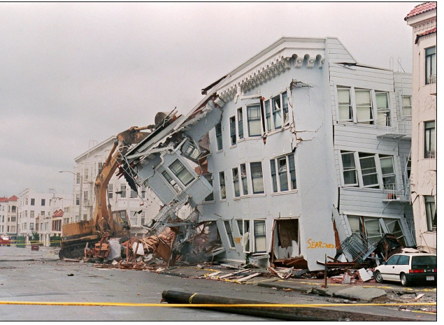
San Francisco - Loma Prieta