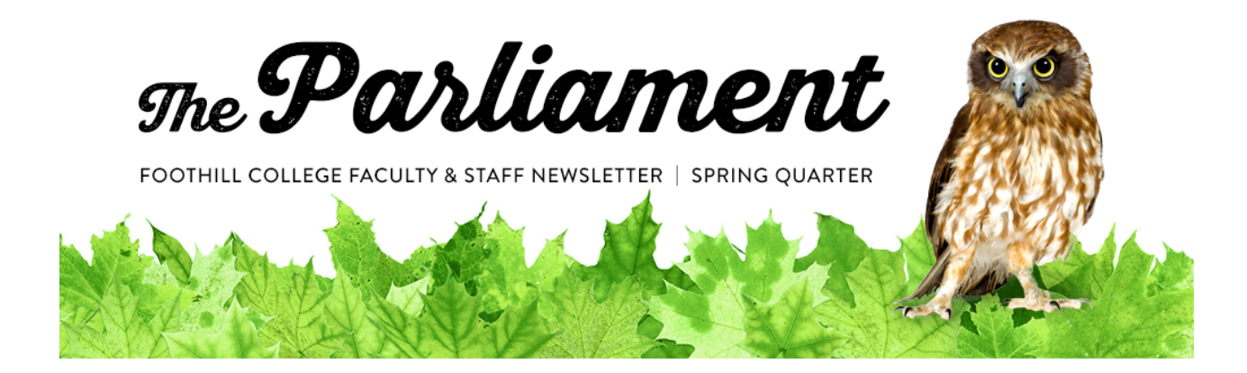
May 14, 2021