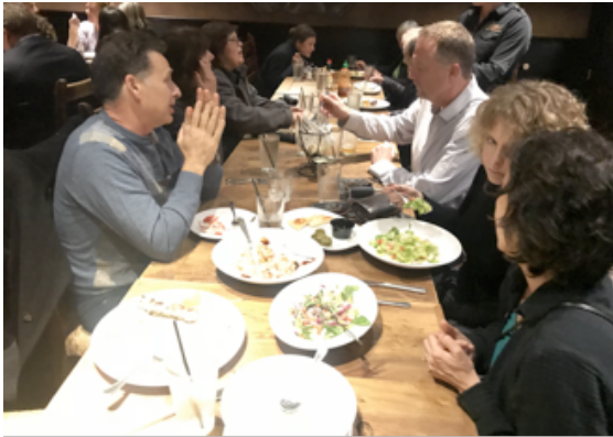
Dinner at Opa before the show "It Can't Happen Here"

Thank you, Foothill College for your humanity, your unyielding commitment to our students. The reason why Service Leadership resonates with you is because you exemplify it!