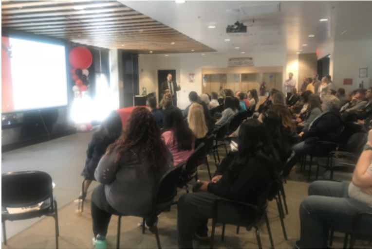
Full house at April 19 Budget Town Hall